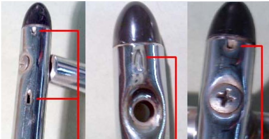
68-76 NOS Corner Note: Weep Holes

Lastly, how do you tell a GM factory luggage rack from the Auto Crafter reproduction? Easy, original luggage racks had a weep hole in the bottom of the tubes right at the end of the rack. This hole was very tiny and when new passed slightly in to the tube to allow moisture out of the rack. It is located just in front of the black cap on the bottom of each tube. All the GM racks had these holes 1968-1976 77 and the god awful ugly 1978-1982 racks. The reproduction racks that were made by Auto Crafters only had a slight depression in the tube at the end and there was not a hole. Now go and check your racks and look for the holes. Please note: Not all GM racks 1968-1976 had the second weep hole in the last tube (as illustrated in the LH picture below. We have found variations both ways.